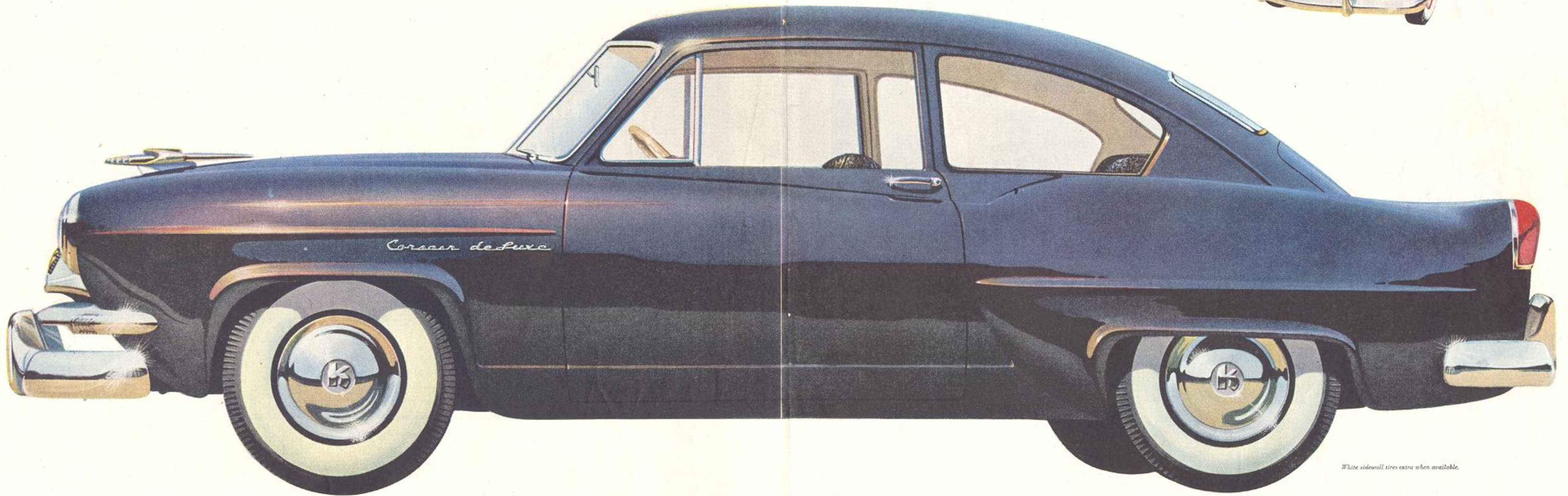
White sidewall tires extra when available.